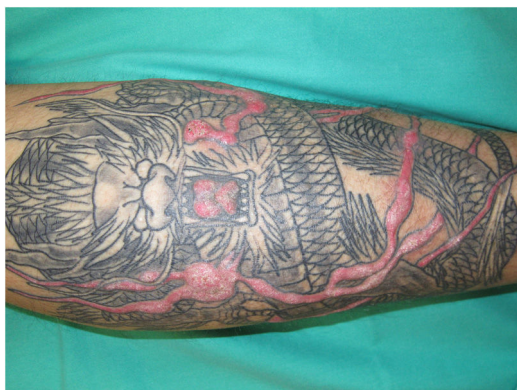
Figure 1 Tattoo on the left leg. Well-defined raised, thickened lesions are evident in the red-colored areas of skin, with no surrounding inflammatory reaction.

A 39-year-old man consulted for an itchy rash in the red-ink areas of a tattoo completed 1 month earlier. Physical examination revealed well-defined, firm, raised, erythematous hyperkeratotic lesions coinciding with the areas of red ink (Fig. 1). Dermoscopy showed rounded or oval-shaped