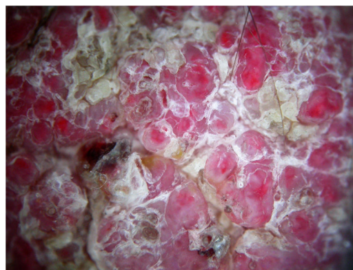
Figure 2 Dermoscopy image. Rounded and oval structures of variable size with an erythematous center and pinkish periphery, separated from one other by yellowish scales.

The patient was diagnosed with pseudoepitheliomatous hyperplasia in skin areas tattooed with red ink.