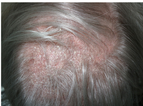
Figure 1 Alopecia plaque with diffuse scaling and underlying erythema.

We report the case of a 73-year-old woman with a history of alopecia plaques that had appeared a year earlier.